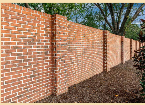
TOP: SIERRA DRYFIT BOTTOM: BRICK